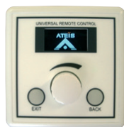
URC Programmable remote controller (RS485).