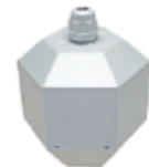
Ethernet Digital Noise Sensing Microphone