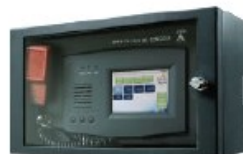
Wall-mounted Touch Screen Paging Console