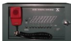
Wall-Mounted Paging Console