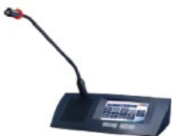
Programmable Touch Screen Paging Console