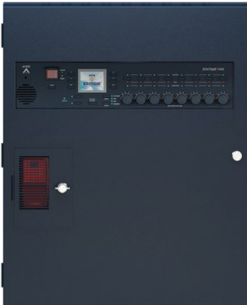
240w or 480w Version